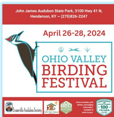
Ohio Valley Birding Festival