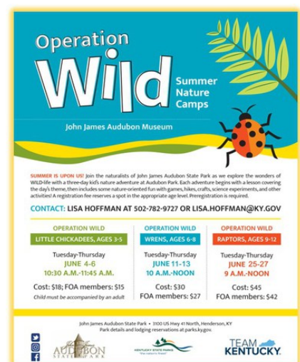
Operation Wild Flyer